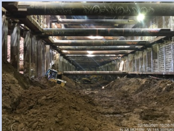
2021-02-16-WR5-WS2-WR52050-LG-continued excavation... continued excavation station box west of entrance. 02/16/2021

Century City Constellation Station is in Century City and will provide access to the Century City Westfield Mall, office space, local bus routes and commuter bus routes. This station has two adjacent developments, one nearing completion and the other starting construction next year. Close coordination with the adjacent developers has been necessary to create a harmonious street scape that is welcoming to the public.